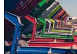
17 COLORS AVAILABLE