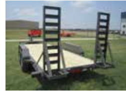
FOLD-UP RAMP AVAILABLE