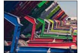
17 COLORS AVAILABLE