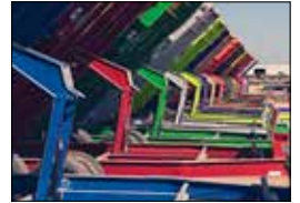
17 COLORS AVAILABLE