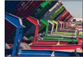
17 COLORS AVAILABLE