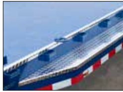
ALUMINUM TRIM PACKAGE AVAILABLE