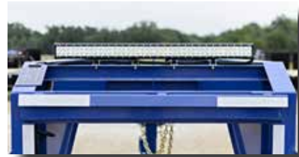
LED Light Bar