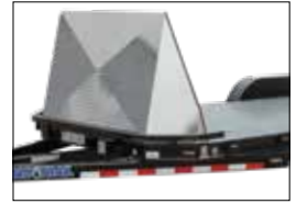
STONE GUARD AVAILABLE