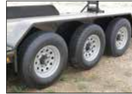
TRIPLE AXLE AVAILABLE