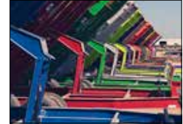
17 COLORS AVAILABLE