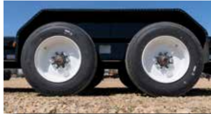
ST215/75 R17.5 Wheels & Tires